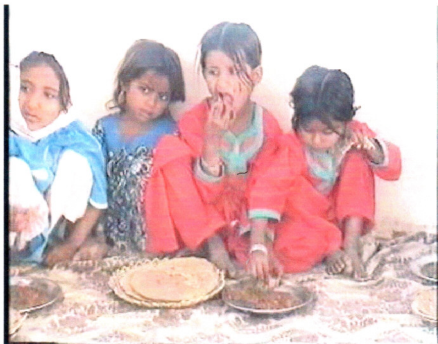
SCHOOL NUTRITION PACKAGE FOR RURAL GIRLS